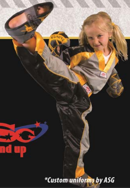
*Custom uniforms by ASG