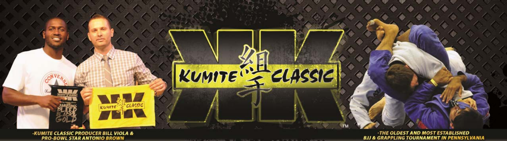
-KUMITE CLASSIC PRODUCER BILL VIOLA & PRO-BOWL STAR ANTONIO BROWN